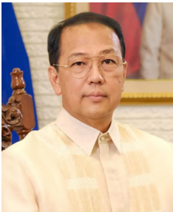
By Sec. Carlito G. Galvez, Jr. Presidential Adviser on Peace, Reconciliation and Unity