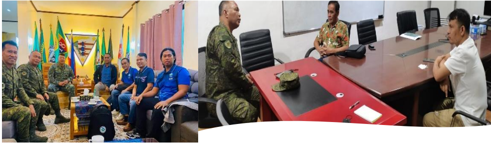
THE BGRY. ULITAN, UNGKAYA PUKAN, BASILAN INCIDENT AND CEASEFIRE INTERVENTION

b. Rido Settlement Monitoring. Recurring problems in the CAAM are conflict characterized by sporadic outbursts of retaliatory violence between families and kinship groups as well as between communities due to land conflict, personal grudges, and politics, among others. It can occur in areas where there is a perceived lack of justice and security. One of the standing orders of the PAPRU, is to make sure that any incidents that may hamper the ongoing ceasefire between the Government and the MILF should be addressed in order to de-escalate a looming problem of rido which may turn into a ceasefire problem.