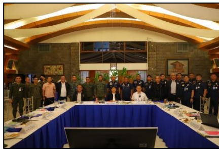
7 th Oversight Committee Meeting at AFPCOC, AFP HQ, Quezon City