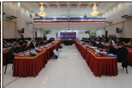
8 th Oversight Committee Meeting at PNP HQ, Camp Crame, Quezon City

The NTF-DPAGs also convened its 8 th meeting on 10 June in which the Task Force Western Mindanao declared that there are no more active private armed groups in Western Mindanao. The Chairperson, NTF-DPAGs also approved the Joint Operational Guidelines 01-2022, the transition work plan to be carried out for the next Administration, as well as the forging of a memorandum of agreement between the different national government agencies to support the provision of rehabilitation and reintegration to the surrendered members of PAGs.