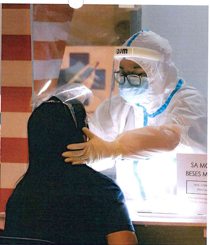
The Office of the Presidential Adviser on the Peace Process (OPAPP) is also involved in the nation's effort to fight against the pandemic through the National Task Force against COVID-19. The NTF COVID-19 spearheads the implementation of the National Action Plan under the Prevent-Detect-Isolate-Treat-Reintegrate (PDITR) Strategy.