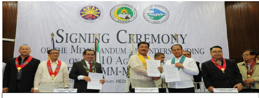
MOA Signing between CHED, MBTHE-BARMM and OPAPP. 30 October 2019, Diliman, Quezon City.