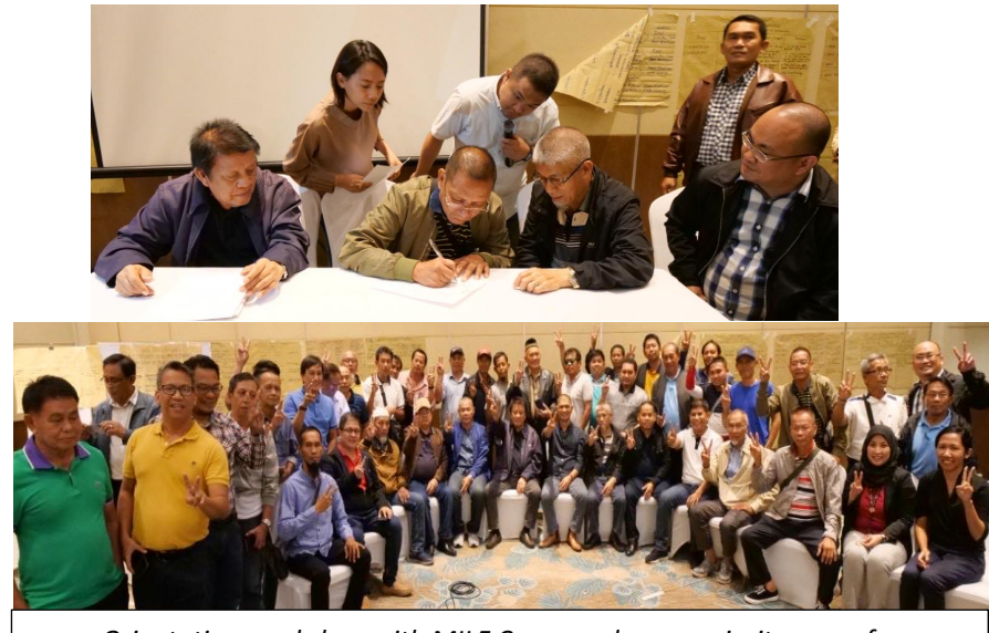
Orientation-workshop with MILF Commanders on priority areas for interventions by the Joint Normalization Committee. 09 December 2019,

The OPAPP initiated the development program for base commands outside of the six previously-acknowledged MILF camps. To jumpstart this initiative, the JNC, together with the United Nations Development Programme (UNDP), held an orientation and workshop in December 2019 for 32 base commands, which served as the venue for each base command to identify priority barangays and propose interventions in these areas.