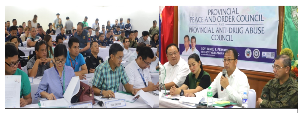
Bulacan Peace and Order Council / Provincial Task Force (ELCAC) Meeting.

The PPOC and PDC issued a Joint Resolution creating the Provincial Task Force on ELCAC.