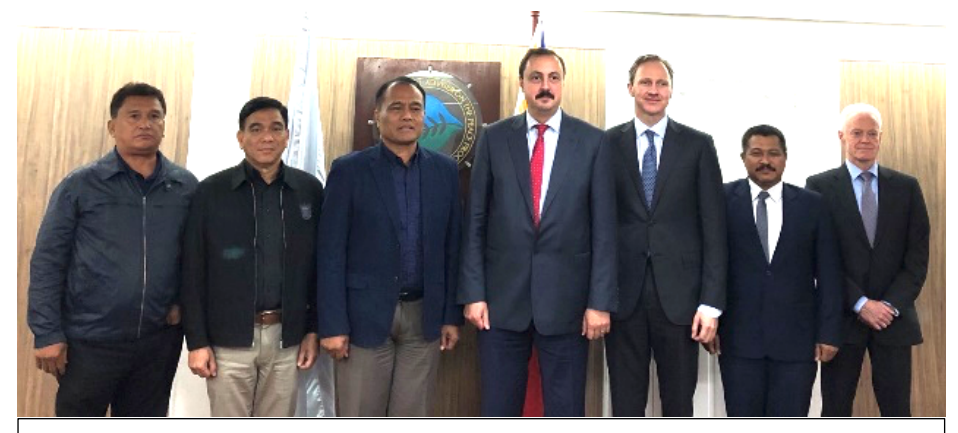
GPH Implementing Panel Meeting with the IDB. 05 December 2019, Ortigas.

5 December 2019 | Ortigas Center, Pasig City. The GPH Peace Implementing Panel met with the members of the IDB to be apprised of the recent updates on the 2<sup>nd</sup> phase of decommissioning of MILF combatants and weapons, as well as for the schedule on the resumption of the 2<sup>nd</sup> phase in the first quarter of 2020.