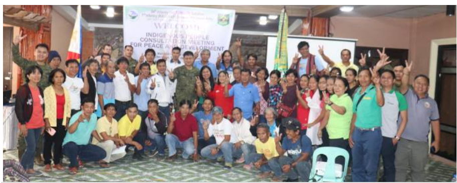
Indigenous Peoples Consultation Meeting for Peace and Development. San Jose City, Nueva Ecija. 28-29 November 2019.