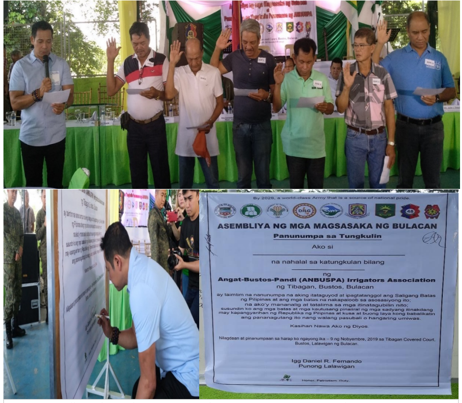
CORDS3 Follow-through Peace Consultative Meeting, 9 November 2019 in Bustos, Bulacan.