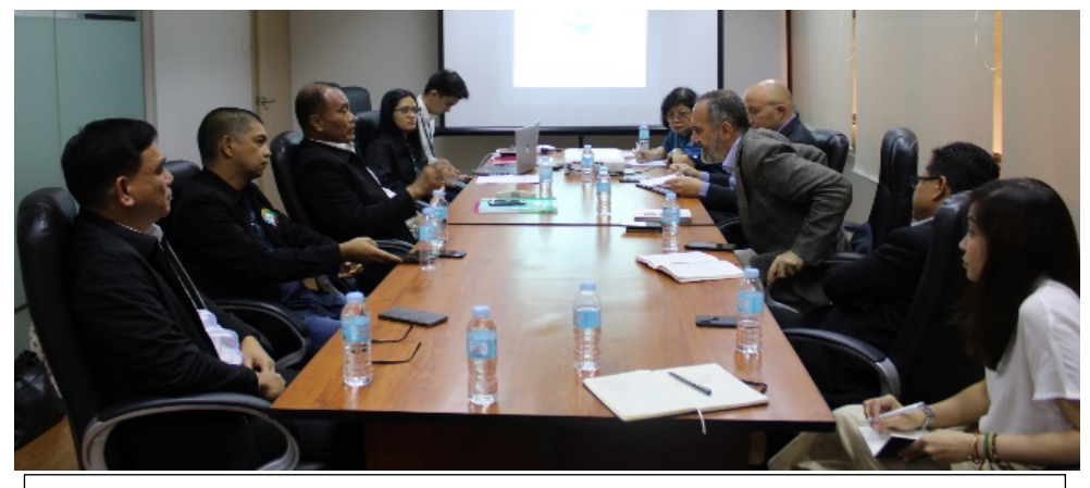
GPH Implementing Panel Meeting with the TPMT. 25 November 2019, Ortigas.