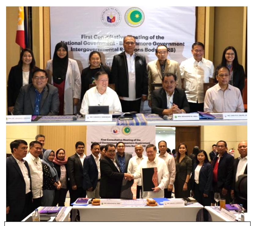
First Consultative Meeting of the IGRB. 16 December 2019, Davao City.