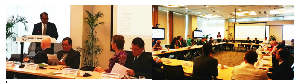
RTD on BNTF. 11 October 2019, Taguig City. The World Bank facilitated the discussions with the diplomatic community, with the participation of the GPH and MILF Implementing Panels.

The RTD on the BNTF with Development Partners enabled the OPAPP to ascertain the interest of the international partners to support the BNTF. This is one of the requirements of the Department of Finance (DOF) to facilitate the request for Special Presidential Authority (SPA) for the OPAPP for the signing of the memorandum of understanding (MOU) with the World Bank for the establishment and operationalization of the BNTF. The other two requirements are the availability of a monitoring mechanism and a draft MOU.