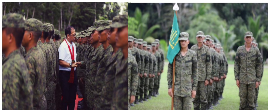
Members of Kapatiran (CPP-NPA rejectionist group) complete their 45-day Community Defense Unit (CDU) training.

On 5 November 2019, the CDU candidates graduated from their 45-day training. The graduates were integrated into the AFP Reserve Force and were eventually deployed to the settlement sites in Tanjay in Negros Oriental, Maasin in Iloilo, Ibajay in Aklan and in Kabankalan, San Carlos, Cadiz, Cauayan, all in Negros Occidental. Aside from the financial assistance received by the candidates from DSWD through their Assistance to Individuals in Crisis Situations (AICS) program, each CDU candidate was provided with food assistance and cash incentive upon their deployment.