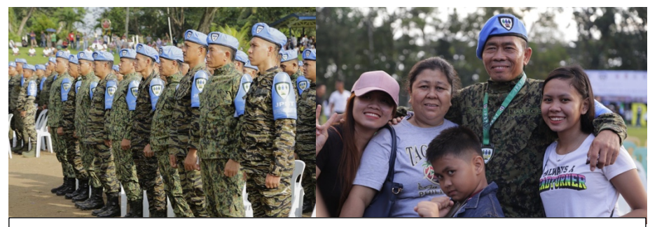
Former MILF-BIAF combatants now participate as Joint Peace and Security Team (JPST) members. 23 November 2019, Parang, Maguindanao

A total of 317 individuals (77 AFP personnel, 90 PNP personnel, and 150 MILF-BIAF members) completed the second batch of the JPST training facilitated by the BARMM PNP Regional Office. The training provided skills and orientation on the duties and functions as members of the JPSTs and sought to create strong partnership between the contingents from the AFP, PNP, and MILF-BIAF that will be jointly deployed in mutually agreed areas.