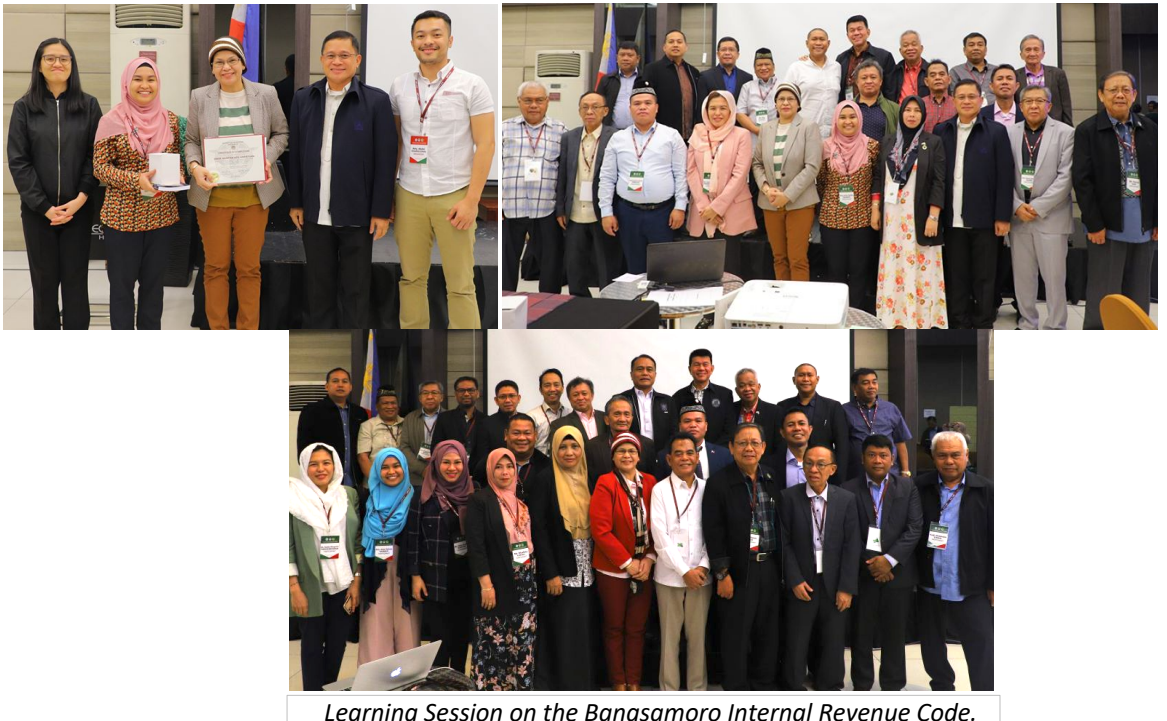
Learning Session on the Bangsamoro Internal Revenue Code. BARMM officials and members of the BTA with OPAPP officials and UP Law lecturers.