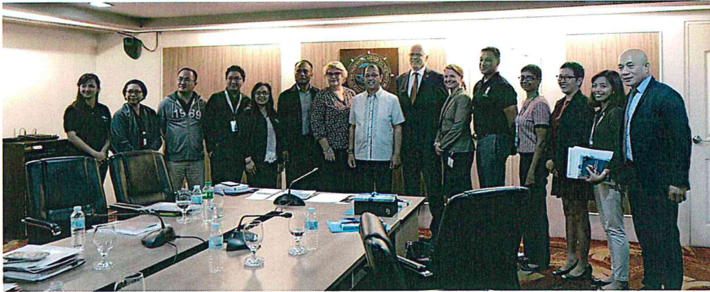
Meeting of the PAPRU with heads of UN agencies (UNRC, UNDP, UNICEF, UN Women and IOM)

to Bangsamoro Transition; USAid; the British Council in the program for Safe, Cohesive and Just Communities; Asian Development Bank; World Bank on the continuing Mindanao Trust Fund for Reconstruction and Development (MTF-RDP) Phase II; with the GIZ projects (Conflict-Sensitive Resource and Asset Management [COSERAM], Strengthening Capacities for Conflict-induced Forced Displacement in Mindanao Program [CAPID], Youth for Culture of Peace); and CSOs and INGOs such as the Centre for Humanitarian Dialogue (CHD).