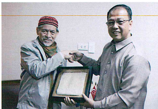
Presidential Peace Adviser Carlito G. Galvez with MNLF Chair Nur Misuari in Pasig City, meet to strengthen commitments to the MNLF peace process.