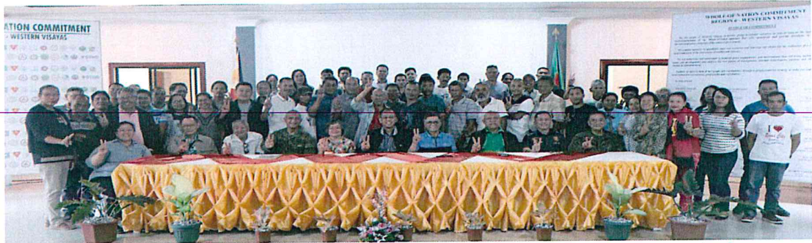
OPAPP dialogue with the TPG/Kapatiran on 26 March 2019 at the Headquarters of the 3 rd Infantry Division, Camp Peralta in Jamindan, Capiz on 26 March 2019.

The draft CID has five components: 1) disposition of forces and arms with provision of interim security arrangements; 2) socio-economic reintegration; 3) provision on the restoration of civil and political rights; 4) community peace dividends for communities influenced by TPG; and, 5) TPG institutional transformation.