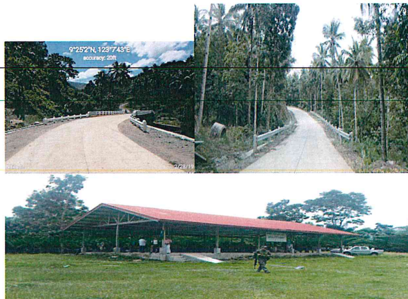
PAMANA Projects delivered as commitments for the GPH and RPA-ABB peace process

The engagements of the JEMC and OPAPP with implementing partners resulted in the formulation of next steps and action plans.