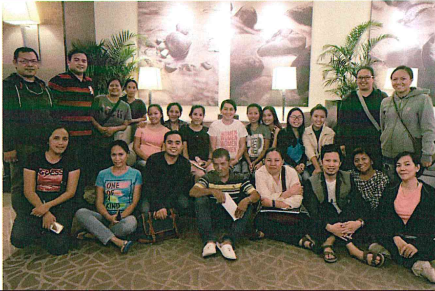
The National Action Plan on Women, Peace and Security Secretariat during the legal catch up with the victims of Marawi Siege