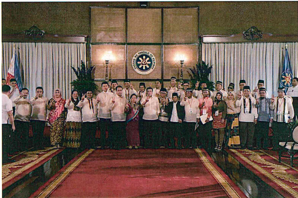
OATH-TAKING OF THE BANGSAMORO TRANSITION AUTHORITY (BTA) at the Malacañang Palace, Manila on 22 February 2019. President Rodrigo Roa Duterte challenged the BTA to always embody the aspirations of the people of the Bangsamoro Autonomous Region in Muslim Mindanao (BARMM) through good governance as they lead in peace and development in the region.

The amount necessary to carry out the requirements of transition shall be charged against available funds in the current General Appropriations Act. The current year's appropriations for the ARMM shall also be transferred to the BARMM. The compensation of the members of the BTA shall be subject to existing rules and regulations of the National Government.