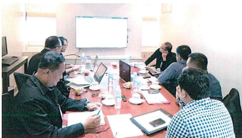
THE JNC SECRETARIAT together with the Security Unit (created under OPAPP), spearheaded the session with the AFP-PDO and PNP-PPDC for the drafting of a Program Document on the Security Component to implement the Normalization Program.

On 13 March, the JNC Secretariat spearheaded the session with the AFP Peace and Development Office (AFP-PDO) and PNP Peace Process and Development Center (PNP-PPDC), together with the newly created Security Unit under OPAPP that will coordinate with the Joint Peace and Security Committee (JPSC) and the Joint Peace and Security Teams (JPSTs), to come up with the Security Component Program Document. This document outlines how the program is to be managed, executed, and monitored. It contains the overall program governance, information on projects, benefits realization, related management plans and procedures, timelines, and the methods used to plan, monitor, and control the program as it progresses. This document will evolve with the processes that the Security Component will undertake from JPST training, deployment, and support to IDB and the decommissioning activities.