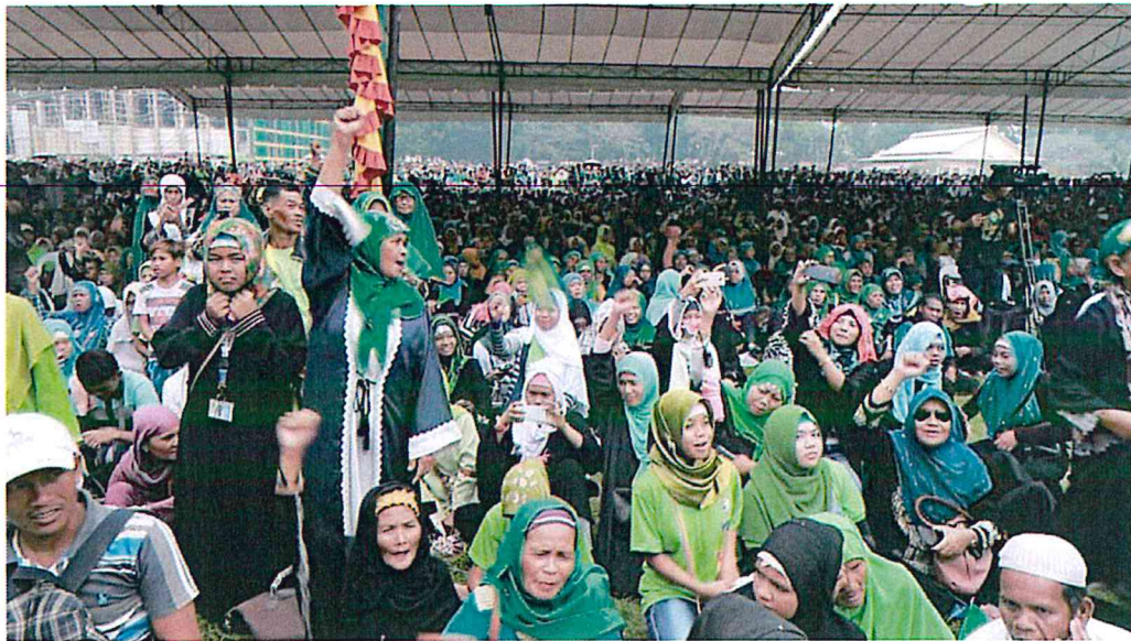
KABACAN, NORTH COTABATO. January 19, 2019 -- An estimated crowd of 150,000 gathered to show support for the ratification of the Bangsamoro Organic Law (BOL). At least 67 villages in seven towns in this province will vote in the plebiscite for inclusion in the future BARMM.

On 25 January, the COMELEC, sitting as the National Plebiscite Board of Canvassers, proclaimed the BOL as deemed ratified, considering that majority of the votes cast in the areas within the present ARMM was in favor of its approval.