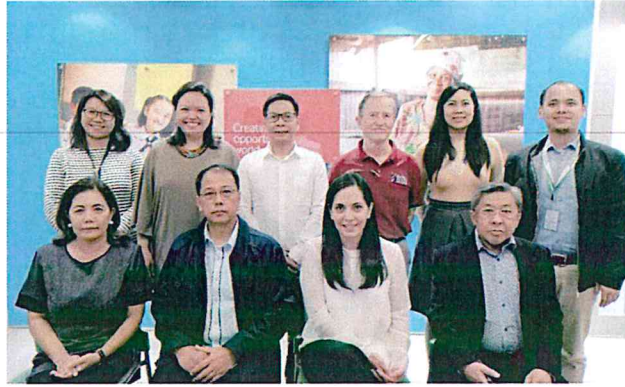
OPAPP meeting with the British Council