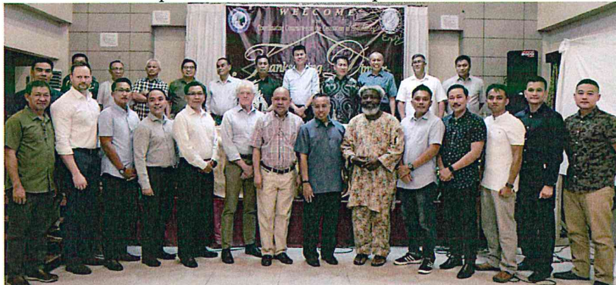
THANKSGIVING DINNER. The CCCH host a dinner in honor of the IMT, attended by officials and members of the Panels, CCCH and IMT.